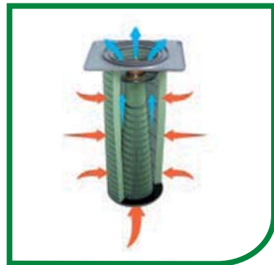
Gold Cone Filter Technology