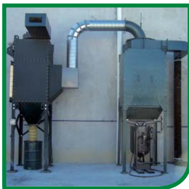
Dust Collector/Recovery & Blast Pot