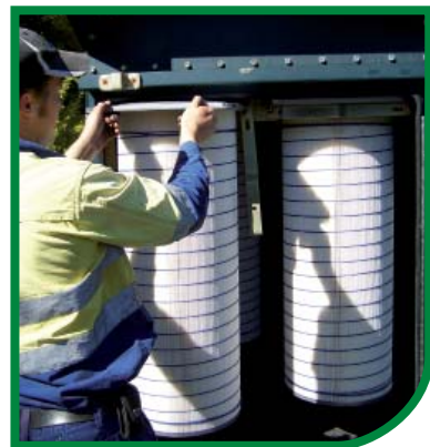
Easy Filter Changes