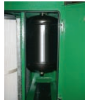
Zephyr II Cleaning Tank