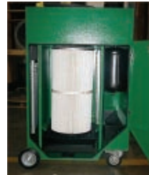
Zephyr II Filter