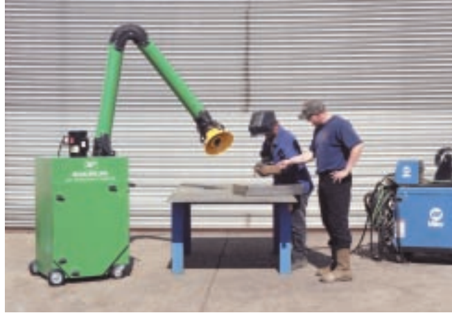
Zephyr II In Action